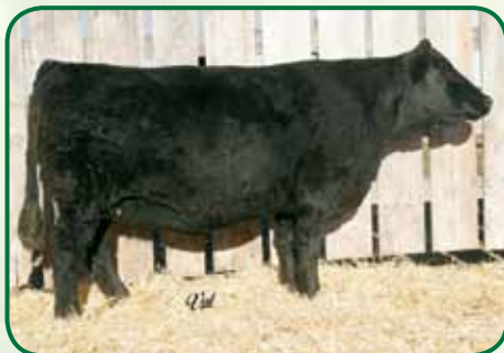
Kappes Sadie M166, Dam

Kappes Pilgrim D174 combines both phenotype and performance. He is long sided, clean made through his front one-third, bold through the center portion of his body, square hipped, big footed and sound structured. He's one of our favorites to date out of Sadie M166 and is sure to make an impact with his offspring.