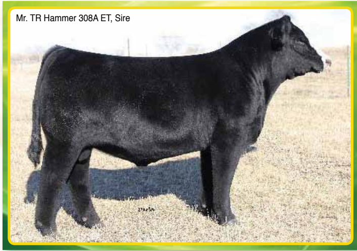
Mr. TR Hammer 308A ET, Sire