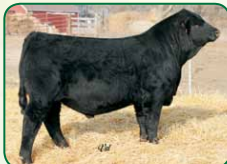
Kappes Super Liner B89, $8,500 Maternal Brother