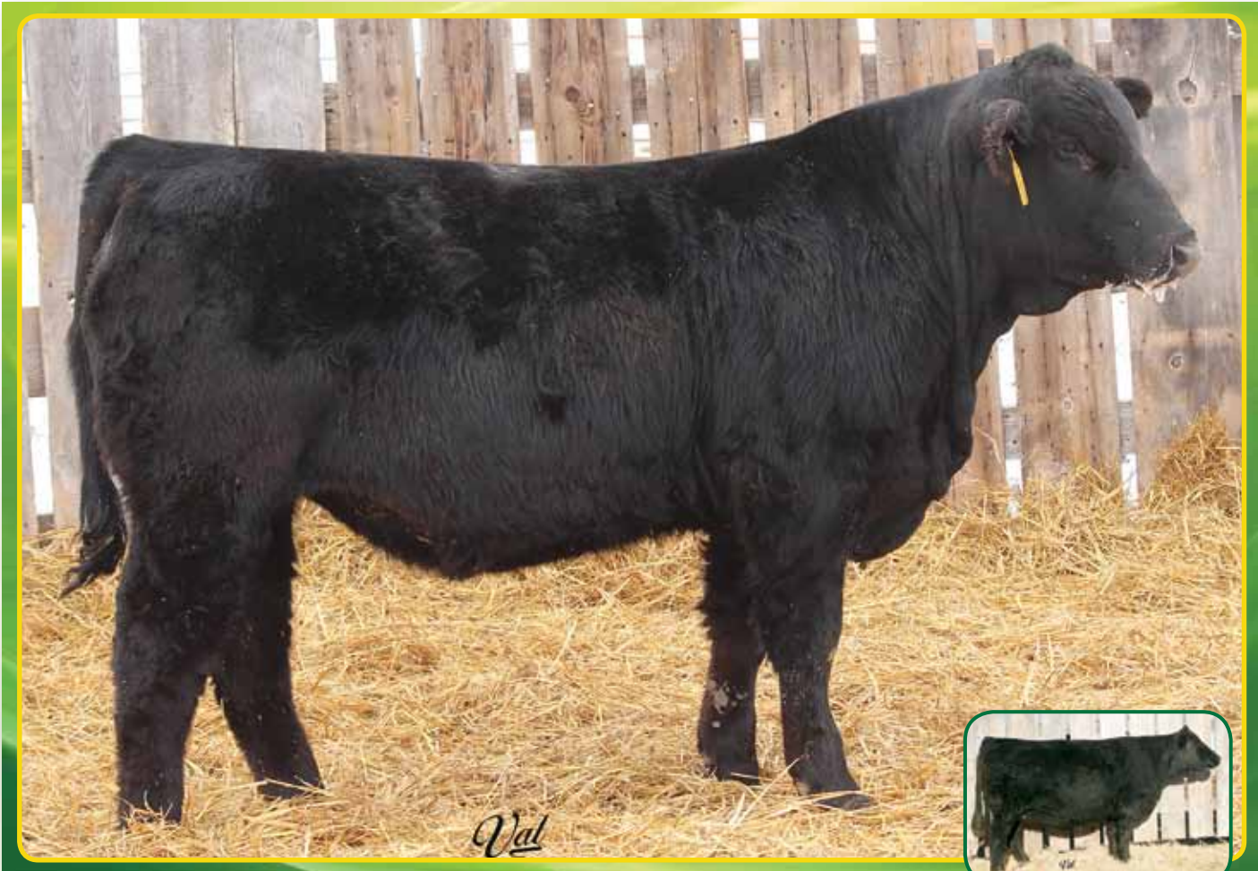
Kappes Sadie M166, Grandam

WAGR Dream Catcher 03R Kappes Megatron A12 SWC Ruby Ynona 139Y GW Premium Beef 021TS Kappes Xylia Z28 B28 Kappes Xylia Z28