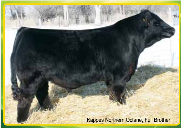
Kappes Northern Octane, Full Brother

He's heavy muscled, moderate framed and big footed.