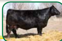
Kappes Sadie T635, Grandam

Power and Performance, these two have it. They are full sibs by pedigree. Stout, powerful, heavy muscled, high performing, thick end and not to mention they are both in the top one percent of the breed on WW, YW, MWW, and CW. If you're looking to add pounds to your cattle and still maintain high percentage Simmentals, then take a look at these two bulls.