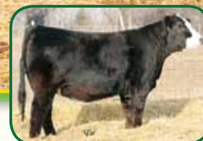
Kappes Lacey T91 A201, $7,500 Maternal Sister

A.I. Sire/Date: SS/PRS High Voltage 244X (SM) 5-30-16 Ultrasound safe to A.I. sire: Heifer • Est. Due Date: 3-6-17 Est. PM EPDs: 10 2.15 68 91 .14 9 18 52 8 11.75 Carcass: 26.45 -.41 .04 -.05 1.09 111 68 Pasture Sire/Dates: Kappes I. Man A633 C75 (SM) 6-24 to 7-27-16