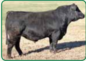
J Bar J Nightride 225Z, AI Sire

Here's a low CE and BW EPD Barstow Cash half blood daughter.