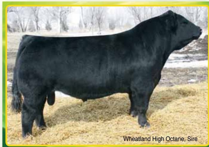
Wheatland High Octane, Sire

Wheatland Predator 922W Wheatland High Octane 169Y Wheatland Lady 351N Mr. NLC Upgrade U8676 SWC Ruby Ynona 139Y JM Miss Olivia-L36