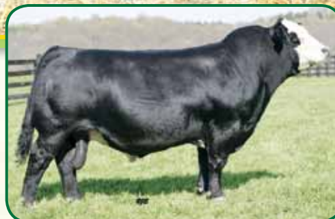
Remington Lock N Load 54U, Sire

Remington On Target 2S Remington Lock N Load 54U Bar15 Miss Knight 78E-51G Mr. NLC Upgrade U8676 SWC Ruby Ynona 139Y JM Miss Olivia-L36