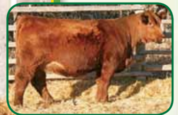
KS Miss Sequoia Y770, Dam