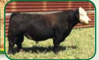
W/C Loaded Up 1119Y, Sire