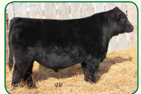
Kappes Thunder 863 C523, $16,500 Maternal Brother