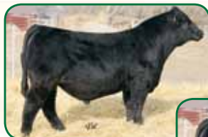
Kappes Main Event B1, $12,000 Full Brother

Kappes Thunder 863-C523, $16,500 Maternal Sibling