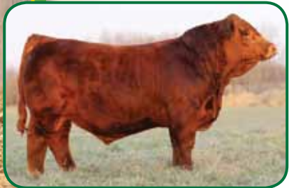
Come As U R Red Rocket, Sire