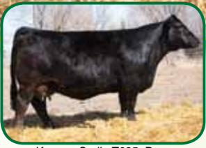
Kappes Sadie T635, Dam

Here's a full sib to our high selling bull in our 2016 sale Kappes Hammertime C505. She's high performing, elegant about her head and neck, big hiped, level built and bold sprung in her upper and lower rib. Sadie T635 has raised some of our high performing cattle and C86 is sure to follow in her mother's footsteps.