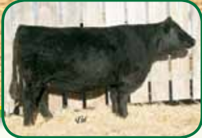
Kappes Sadie M166, Dam