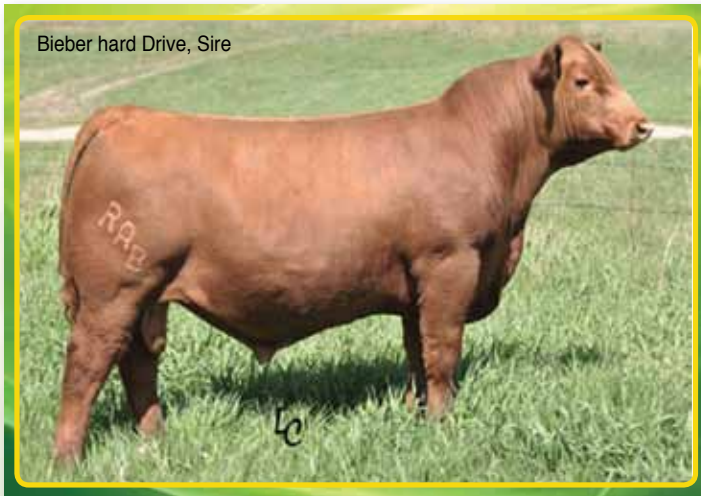
Bieber hard Drive, Sire

Long sided, stout featured, heavy muscled, and big hiped Rictor son.