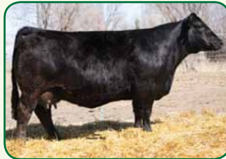
Kappes Sadie T635, Grandam