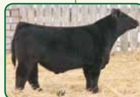
Kappes Megatron A12, AI Sire

A long sided, powerfully built Archie daughter that is in the top three percent for both WW and YW EPD.