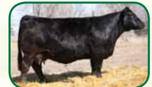
Kappes Sadie T635, Dam

Here's a full sib to our high seller bull a few year back Kappes Northern Octane. He's heavy muscled, stout made and big hiped.