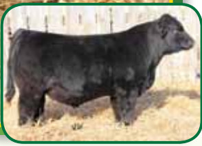
Kappes Hammertime 90 C505, $18,500 Full Brother