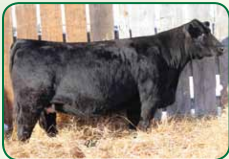
Kappes Sadie T635 Z624, Dam