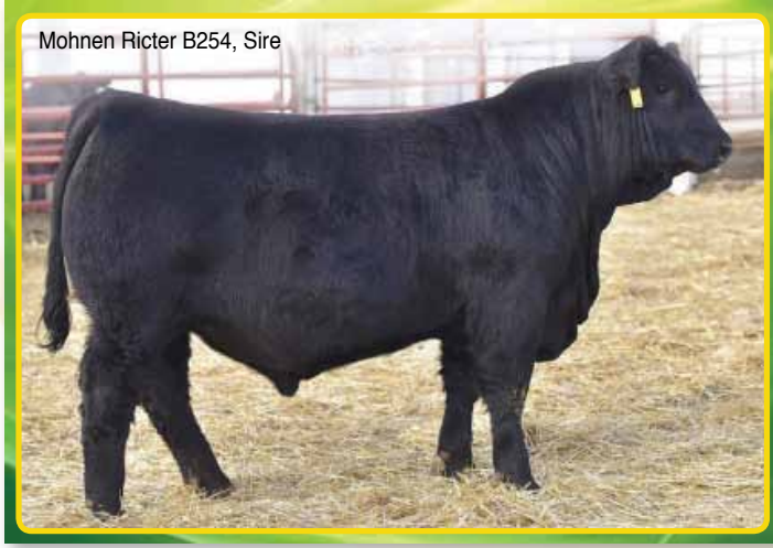
Mohnen Rictor B254, Sire