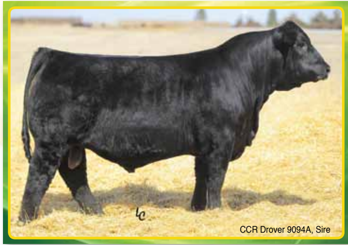
CCR Drover 9094A, Sire