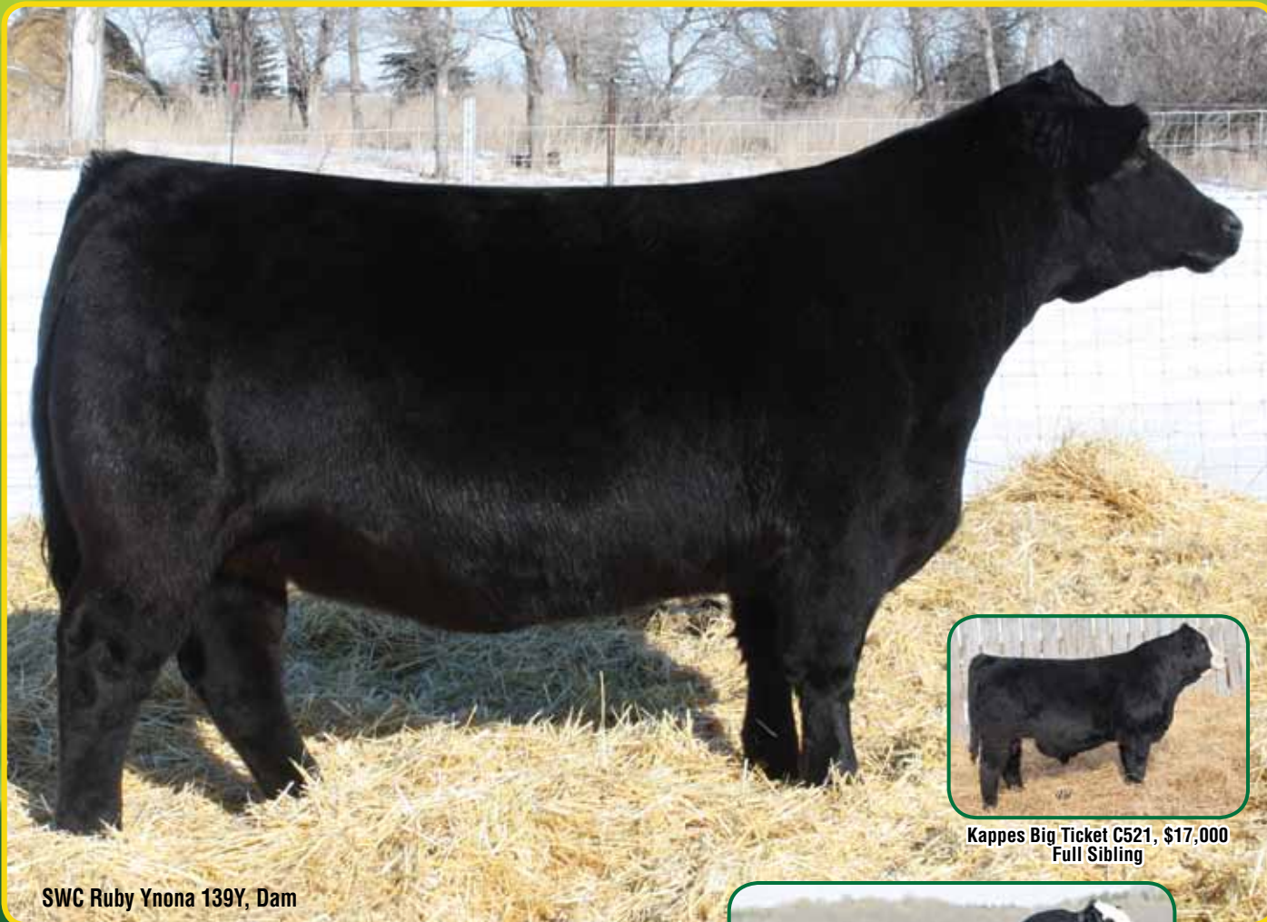
SWC Ruby Ynona 139Y, Dam