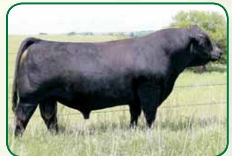
WS Pilgrim H182U, Sire