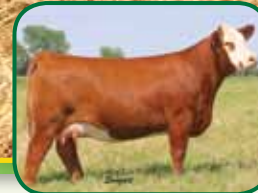
W/C Miss 4770, Full Sister