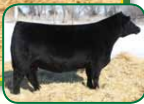
SWC Ruby Ynona 139Y, Dam