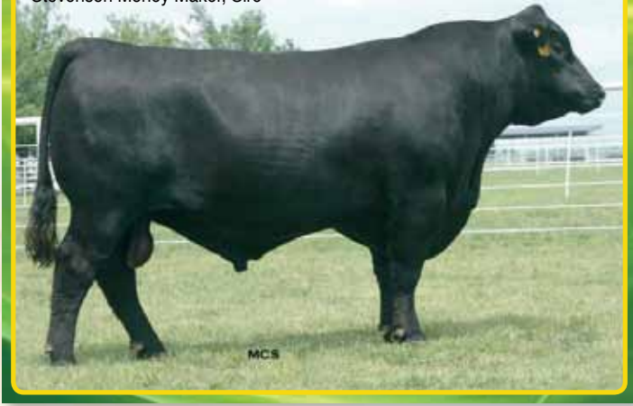
Stevenson Money Maker, Sire

Boyd On Target 1083 Stevenson Money Maker R185 Stevenson Clova Pride L888 Berbos Traveler 044 030 3267 Kappes SAV E Pride 7021 U127 S A V Pride 7021