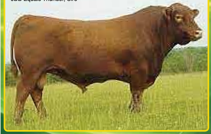
JDB Equals Thunder, Sire

Here's a smooth made, bold sprung, good necked, soft pasterned, purebred Red Angus bull.