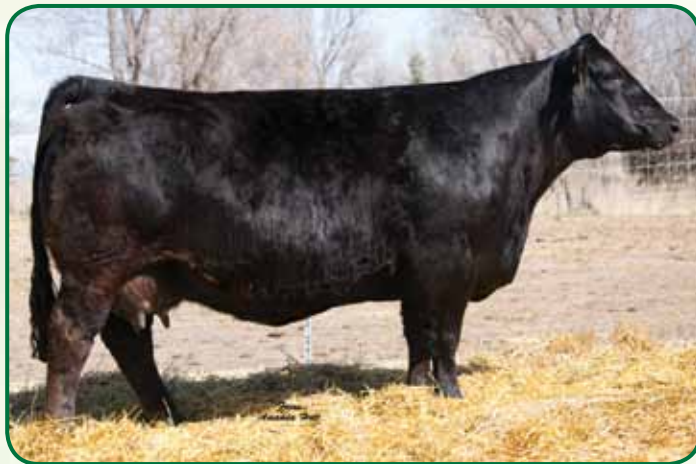
Kappes Sadie T635, Dam