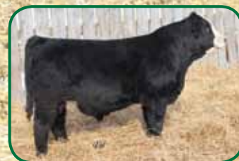
Kappes Big Ticket C521, $17,000 Full Sibling