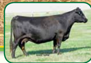
ALC Treasure C50P, Grandam